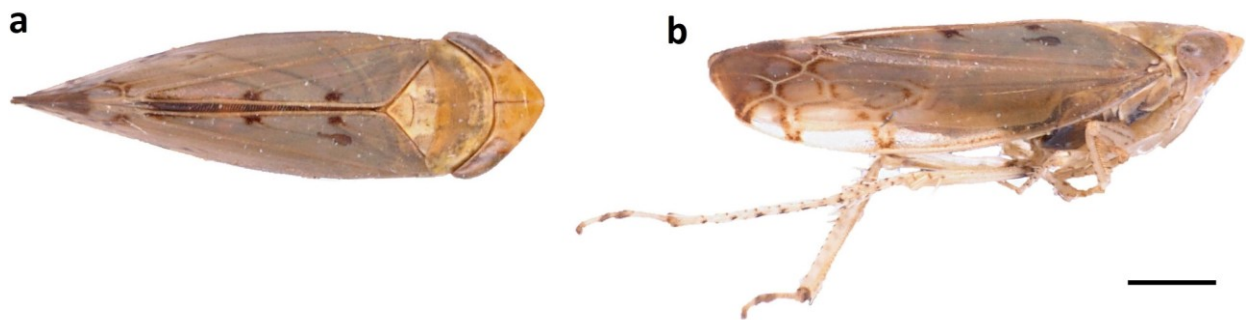
Figure 2. Synophropsis lauri (Horváth, 1897) female. a = dorsal view; b = lateral view. Scale bar = 1 mm.

The last checklist of leafhoppers and plant-hoppers of Hungary published by Györfy et al. (2009) listed 540 species. Since then several species have been added to the list: P. annulata (Koczor et al. 2011), Graphocephala fennahi Young, 1977 (Papp et al. 2012), Liguropia juniperi (Lethierry, 1876), Opsius smaragdinus Emeljanov, 1964 (Koczor et al. 2012), O. ishidae (Koczor et al. 2013) and Tautoneura polymitusa Oh & Jung, 2016 (Tóth et al. 2017). With the newly recorded L. maculipes and S. lauri currently 548 Auchenorrhyncha species are reported from Hungary. According to A. Orosz, as a result of different faunal collections ( e.g. Hungarian Biodiversity Days and the field program of 5 th European Hemiptera Congress) there are some additional unpublished records of Auchenorrhyncha new to Hungary, and therefore, the presumed number of Auchenorrhyncha species in Hungary exceeds 560.